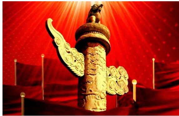
Figure 3 Cultural confidence

The inheritance and sublimation of the excellent traditional culture in the new era is the internal motive force for the construction of cultural self-confidence