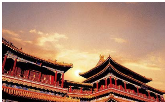
Figure 2 Cultural confidence